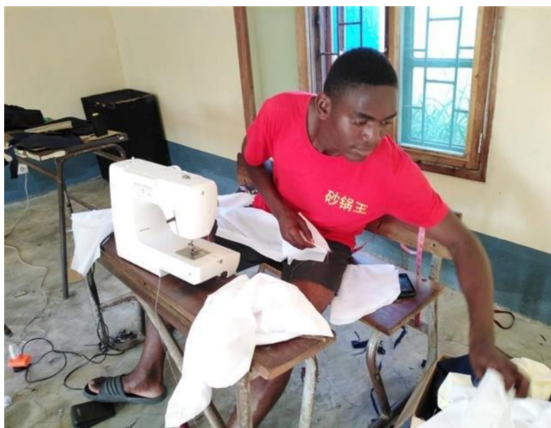
One of the boys sewing

With further extensions, the long period of lockdown that stretched from April to October 2020, resulted in schools and many businesses being closed. This interrupted education, diminished career opportunities and caused disruption to the supply of food and raw materials imported from outside the country. The weakening of the Mozambican metical and supply shortages led to higher prices in the shops and have been challenging for those young men and women trying to establish homes and livelihoods around Beira.