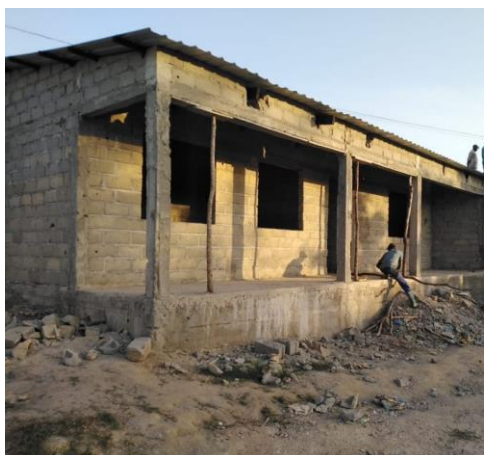
New office block under construction

Work began on a new office block at Casa Reom as well as a new sanitary block for Escola Reom. The roof of the new office block is partly built with reinforced concrete to provide a secure record store for the Casa Reom and Escola Reom. The new sanitary block will take the pressure off the shower and toilet block that is for Casa Reom boys.