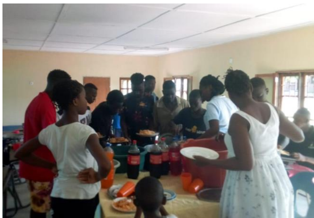
Eating dinner in new dining room

The new Dining Room and Kitchen was commissioned in early 2020. Equipment for the kitchen is still to be provided and school desks are in temporary use in the dining room until tables and chairs are made. The staff and boys had their first meal together in the new building to mark the beginning of 2021. The decision to 'build back better' means that this room will become a focal point for many community activities for Casa Reom and people outside the centre. The new kitchen also includes a bigger store, allowing Casa Reom to get cheaper bulk purchases.