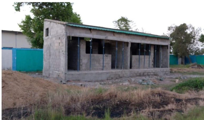
Escola Reom school sanitary block under construction