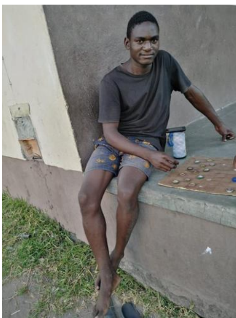
Boys relaxing during lockdown

When the Casa Reom site was closed, the gates were locked and everyone coming onto site was required to wash hands. The boys had to innovate to find ways of entertaining themselves and one of the staff members, Nelio, began teaching the boys how to make face masks and other items of clothing. Thanks to the gift of two more new sewing machines, the boys were kept busy.