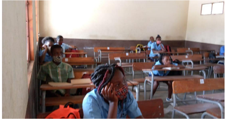
Escola Reom school reopens in October

The year began with staff and teachers holding meetings with parents of children joining the school in 2020. The venue was the dining room with a capacity to hold over 100 people. The meetings present parents with the opportunity to ask questions about the operations and future plans for the school and their children. A few of the Casa Reom based boys attending Escola Reom school failed their end of year exams and had to repeat the tests in 2020.