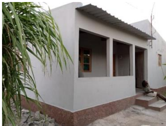
A house for a widow with three young children and who lost her job due to Covid-19 pandemic, was built back better after cyclone Idai